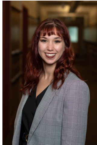
RACHEL GREEN ARTICLES EDITORS